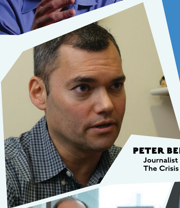
PETER BEINART Journalist / Author The Crisis of Zionism