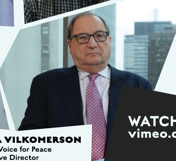
ABRAHAM FOXMAN Anti-Defamation League National Director Emeritus